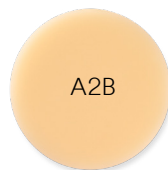
A2B 3M™ Filtek™ Supreme XTE Universal Restorative