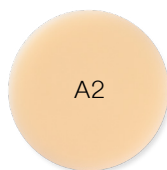
A2 3M™ Filtek™ Universal Restorative